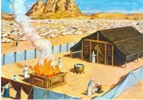
The Tabernacle in the Wilderness

There were other things like the dream of Nebuchadnezzar showing from Babylon on down to the Medes & Persians, to Greece, to Rome, all empires that had rule over the world, then the feet of iron mixed with clay, which represented the weakness at its end. Also, many had the drawing of a large hand, showing what part each finger represented the thumb, representing the Apostle, the next finger being the Prophet, the index finger was the Teacher, the ring finger representing the Pastor and the small finger, the Evangelist. Reading from Ephesians 4, it names the five gifted ministry that was to lead the church into perfection.