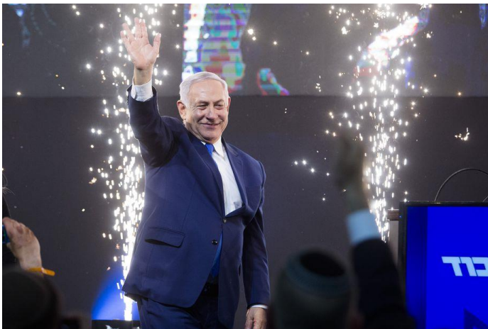
As the results came in on election night, Mr. Netanyahu waves to his supporters.

Israeli Prime Minister, Benjamin Netanyahu, has managed to hold onto power, winning what will be a record fifth term in office despite a bruising re-election fight.